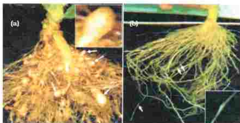
Figure 10.2 Host plant-generated dsRNA triggers protection against nematode infestation: (a) Roots of a typical control plants; (b) transgenic plant roots 5 days after deliberate infection of nematode but protected through novel mechanism.